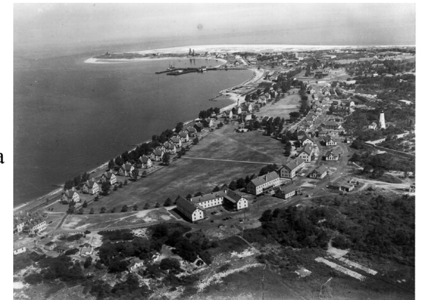
Sandy Hook circa 1930

The weapons and tactics of World War II made harbor defense forts obsolete. While many similar forts were closed, Fort