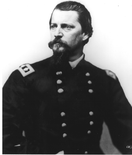
General Winfield Scott Hancock

From 1900 through 1910, the post grew as other buildings were added. Most notable